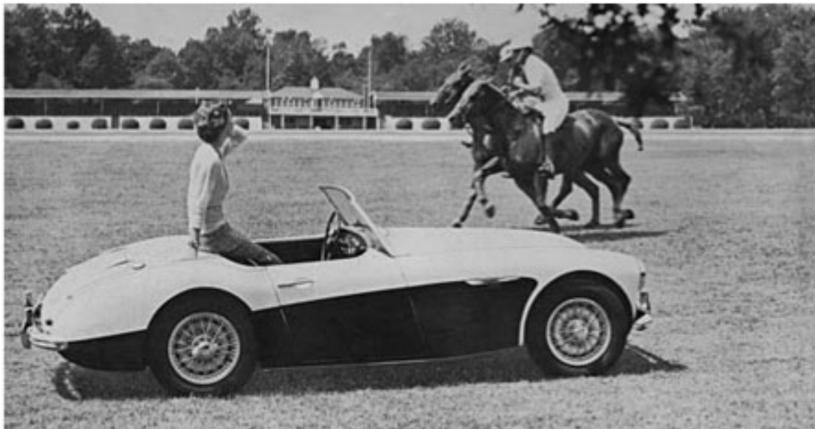
Photographed at the Blind Brook Polo Club, Purchase, N.Y.