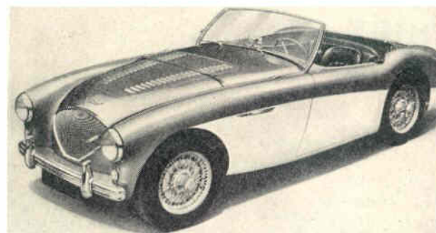
The Austin-Healey 100M

ANTI-SWING DE- VICE on the doors of the latest Austin- Healey "100" Six, in the form of a simple adjustable friction arrangement which prevents the doors swinging to accident- ally when the car is on a camber.