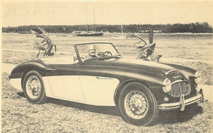
Designer Donald Healey at the wheel of the new 100-Six in Nassau