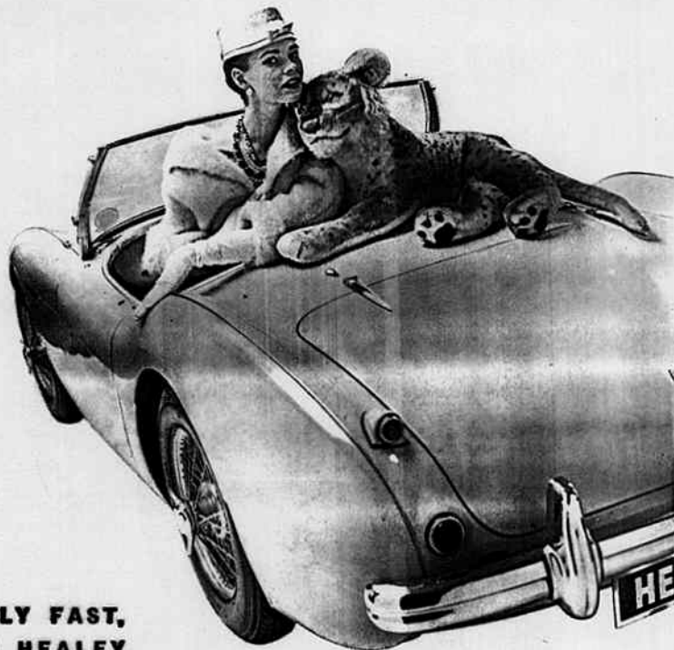
Mohair coat and jersey hat by Jaeger